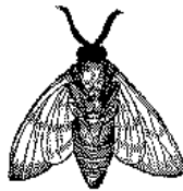
Figure 2: A sample black and white graphic (.eps format) that has been resized with the epsfig command.

a single-column table, this wide table will “float” to a location deemed more desirable. Immediately following this sentence is the point at which Table 2 is included in the input file; again, it is instructive to compare the placement of the table here with the table in the printed dvi output of this document.